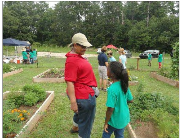
The community garden in Mableton, one of Atlanta’s Lifelong Communities, provides opportunities for community engagement, growing healthy food, physical activity, and intergenerational interaction.