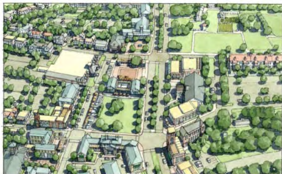
The above images illustrate existing (top) and planned development for part of suburban Mableton, a Lifelong Communities case study site located about 12 miles west of downtown Atlanta.