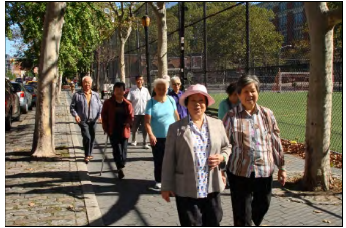
Safe Streets for Seniors was folded into work under Age-friendly NYC.

In the early stages of Age-friendly NYC, as City agencies were assessing their own work for age-related opportunities, Safe Streets for Seniors was identified as a program that could be bundled into the initiative.