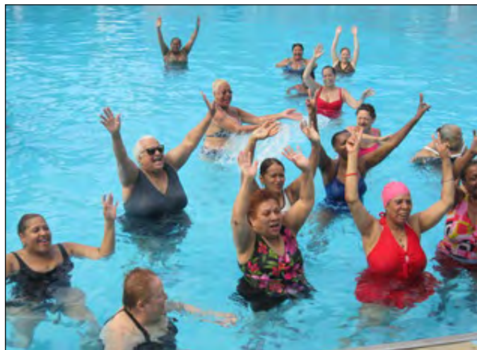
In East Harlem, Age-friendly NYC’s first pilot Aging-improvement District, seniors-only hours at a public pool are offered free twice a week. Based on its success, more than a dozen pools in the city now offer senior hours. This type of program is simple and inexpensive to implement.

The Atlanta Regional Commission also supplies examples of best practice ordinances to help municipalities craft senior living and personal home